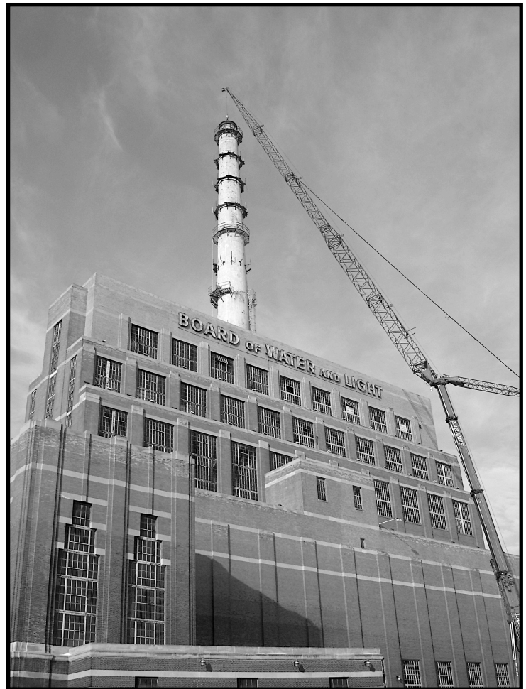
Ottawa Power Plant Smoke Stack Removal - December 2007 The Newly Renovated Building Recently Reopened As The Headquarters Of The Accident Fund

President, Historical Society of Greater Lansing