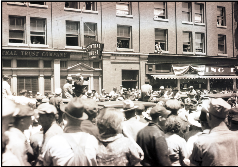
Lansing workers crowd 100 block of West Ottawa during the Labor Holiday.

The Governor stepped out on the Capitol steps at 2:30p.m. and spoke to the crowd. He called for an investigation into the conditions leading to the holiday, cautioned against the use of violence, and assured the strikers of their right to peacefully assemble and protest. He promised to immediately call a meeting of local authorities, strikers, and the prosecuting attorney.