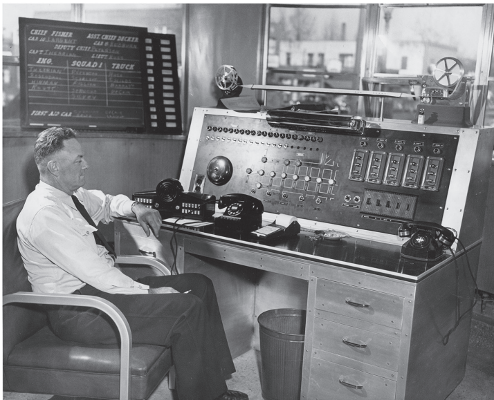
A new control desk at Lansing Fire Department Station No. 1, 1949